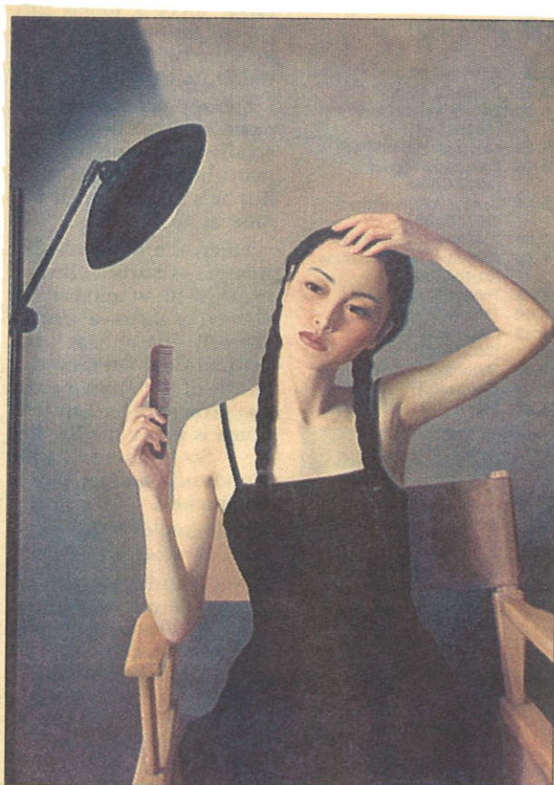
Beauty in black: Red Powder Beauty is part of an exhibition of works by Beijing artist Li Gui Jun at Schoeni Art Gallery in Central.