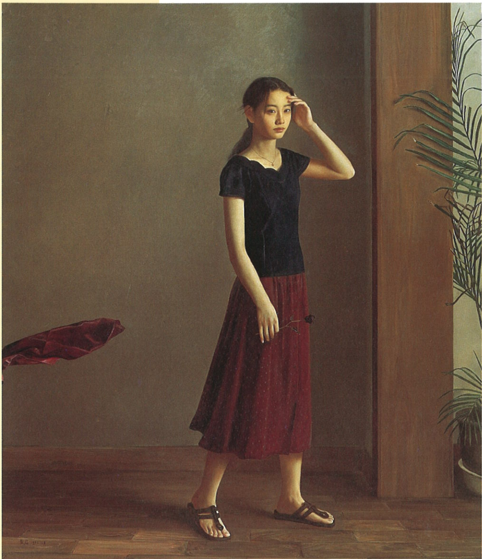
Red Scarf 紅絲巾